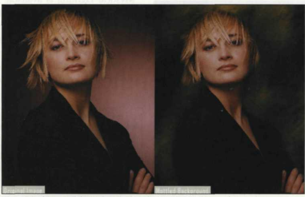
The original image (left) is altered using the Mottled Background control.

trols. We found the easiest way to see how these filters work was to download both the samples and the Mystical Lighting PDF file. The tutorial walked us through all the features, allowed us to try many of the filter presets, so then we felt confident using these lighting filters.