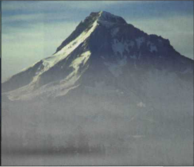
Right: Final image showing Wispy Mist applied to mountain.

tical Lighting Rainbow can be placed wherever you want with intensity and opacity that parallels real world images.