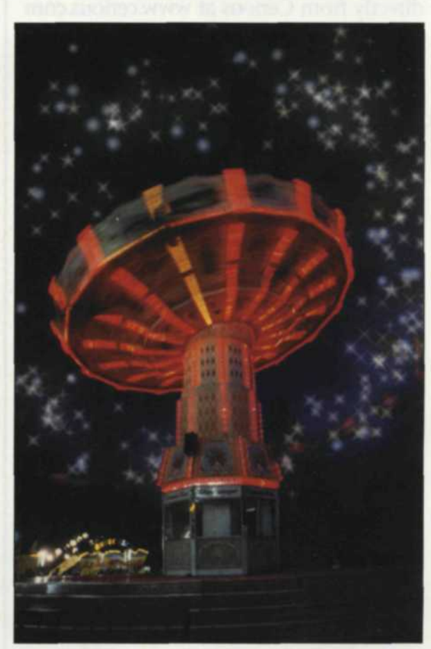
Right: Stock color slide image of carnival ride at night with "Fairy Dust" Filter applied. Since the original exposure was long, it was ideal for this filter.