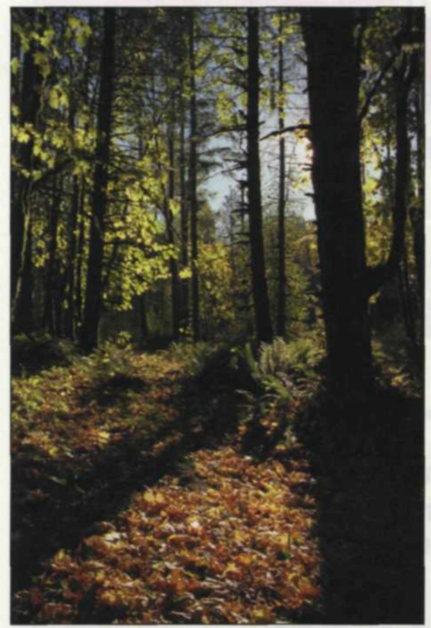
Above: Stock Image taken on Portra 400UC color negative film and scanned into computer via Nikon 4000ED film scanner.

Middle: The highlight area in the image was select-