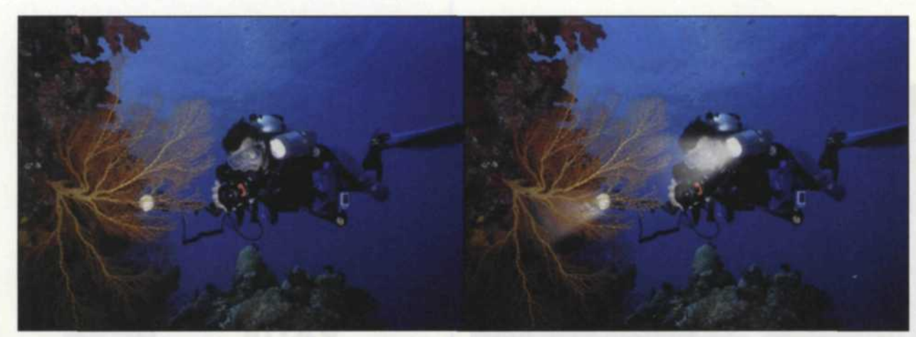
Above: Underwater stock image taken in Fiji with Sea & Sea YS120 flash systems. Above Right: Mystical Lighting Light Caster filter was